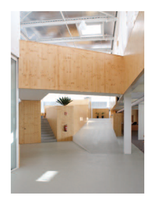
2 — Public Library and Regional Archives, Angra do Heroísmo (Azores), Inês Lobo. Photography: Atelier Inês Lobo