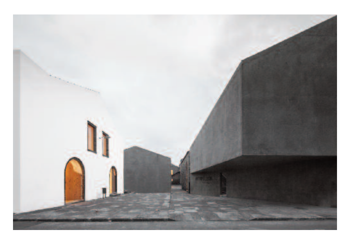
1 — Arquipélago - Center for Contemporary Arts, São Miguel (Azores), João Mendes Ribeiro and -é+ (Cristina Guedes and Francisco Vieira de Campos).