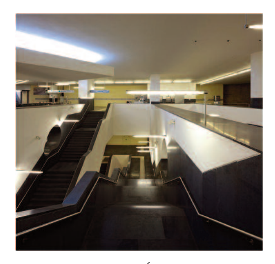
5 — Naples Metro, Naples, Álvaro Siza, Eduardo Souto Moura and Tiago Figueiredo.